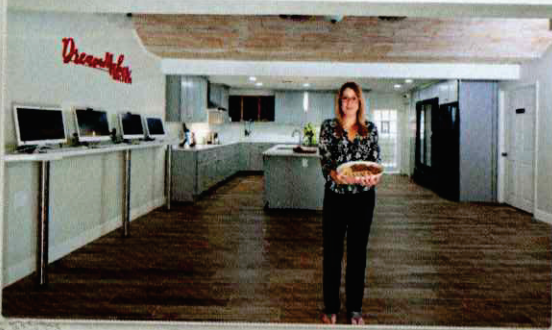
Mrs. Rina's House of Blessings

Mrs. Rina's House of Blessings is a 7,000 sq ft house for families with students in the Martin County school district to temporarily stay as they get back on their feet.