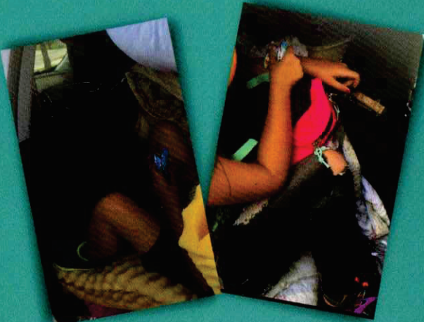
*Photos of our students in crisis

Mrs. Rina's House of Blessings is a 7,000 sq ft house for families with students in the Martin County school district to temporarily stay as they get back on their feet.